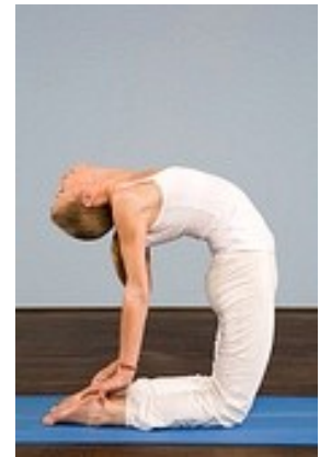
Camel pose stimulates and opens the heart, fostering self-acceptance

tion to help people with mild to severe depression, anxiety, menopause, and mood disorders.